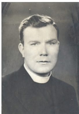
Father Peyton was born January 9, 1909 in Attymass, County Mayo, Ireland

Family prayer invites God into family homes and hearts as the most powerful force in heaven or on earth. It is family prayer that unites the family in unbreakable bonds of love, peace, trust, and joy. Father Peyton summed it up well when he often said, “The family that prays together stays together.”